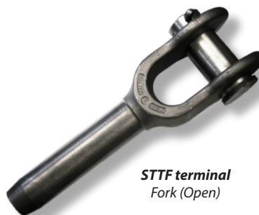
STTF terminal Fork (Open)