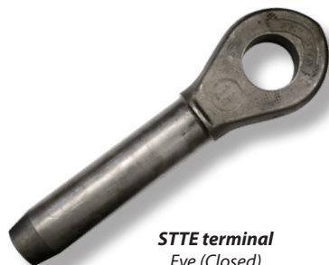
STTE terminal Eye (Closed)