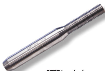
STTT terminal Threaded swage terminal