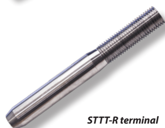
STTT-R terminal Reinforced threaded swage terminal