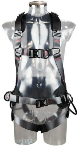
Work positioning D-ring

Marking: According to standard, CE-marked, UKCA-marked, supplier symbol, product identification, size/length, production date and serial number.